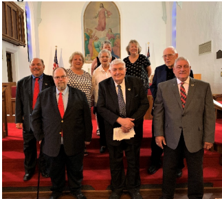
Patuxent Lodge sponsored religious service for the residents of Bonnie Blink