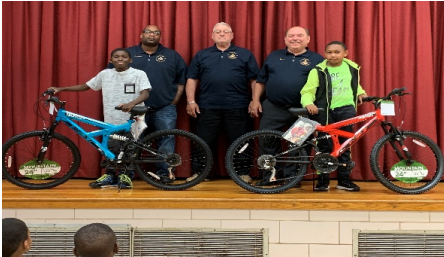
Winners of the Perfect Attendance Challenge from Patuxent Elementary School