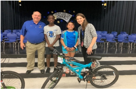
Winners of the Perfect Attendance Challenge from Tracy's Elementary School.