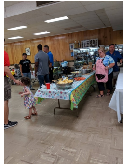
Patuxent Lodge Family Picnic