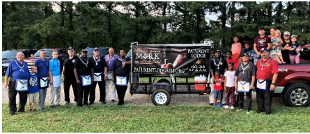
Members of Patuxent Lodge and their families participating in the Deale Firemen's Parade