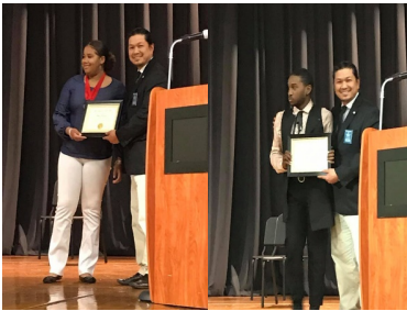
Patuxent Lodge Scholarships being presented at Suitland High School