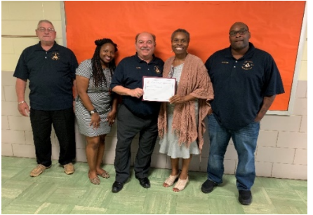
Certificate of Appreciation being presented to Patuxent Lodge from Patuxent Elementary