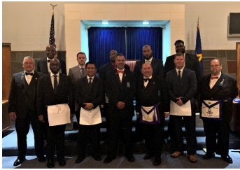
8 Worthy brothers of Patuxent Lodge passed to the degree of Fellowcraft