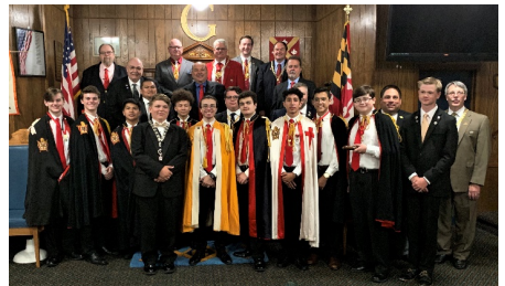
Bowie-Collington DeMolay Installation of Officers