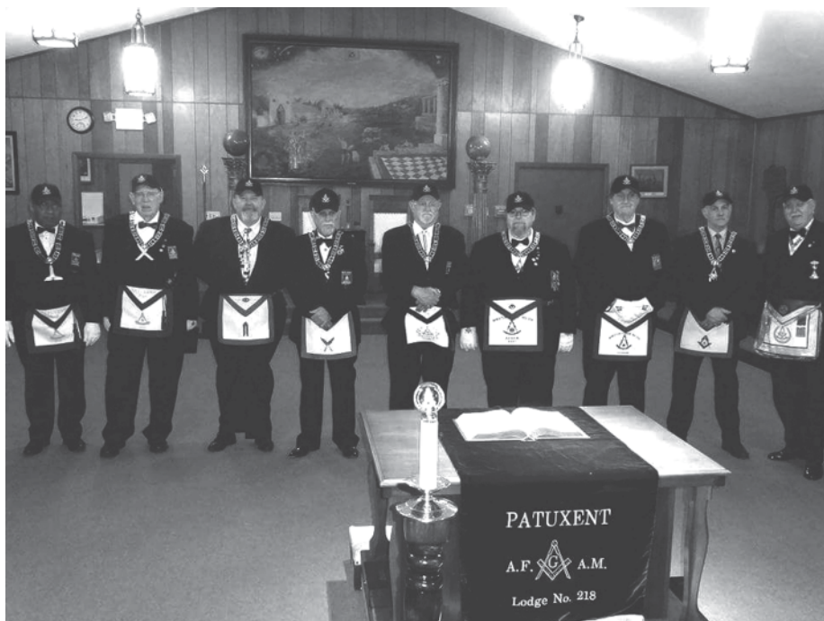
Nine Worshipful Brethren of Patuxent Lodge No. 218 were honored at our Past Masters Night and Lodge anniversary meeting. Each received a PM cap embroidered with our lodge name on the back.